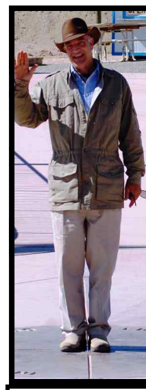
Hello from Four Corners